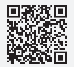
Visit our product page

The Magnetic Grabber<sup>®</sup> is a patented vehicle exhaust removal device and winner of the reddot design award.