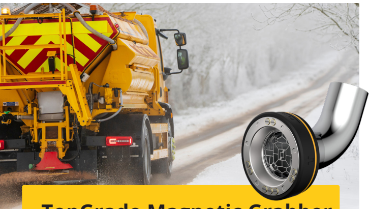
TopGrade Magnetic Grabber