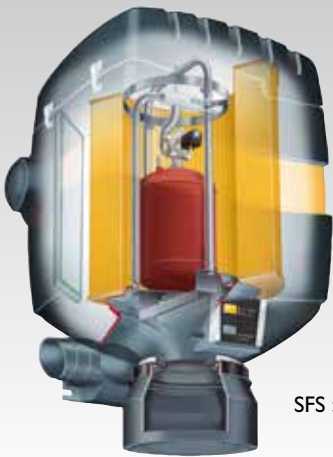
SFS : RoboClean® system

The SFS has the RoboClean® system and a large 30 m 2 (325 ft 2 ) filter, treated with SurfacePlus®. This gives the SFS a very special position in the self-cleaning filter market. The automatically initiated, powerful and deep-working blast of air penetrates into every section of the filter. This is beneficial because it means longer intervals between the pulses, which results in lower energy costs for the customer and a more consistent extraction flow for the welder. The residue is collected in a container, making it easy to remove. No other device on the market is comparable to the stationary Plymovent SFS welding fume filter in terms of price and performance.