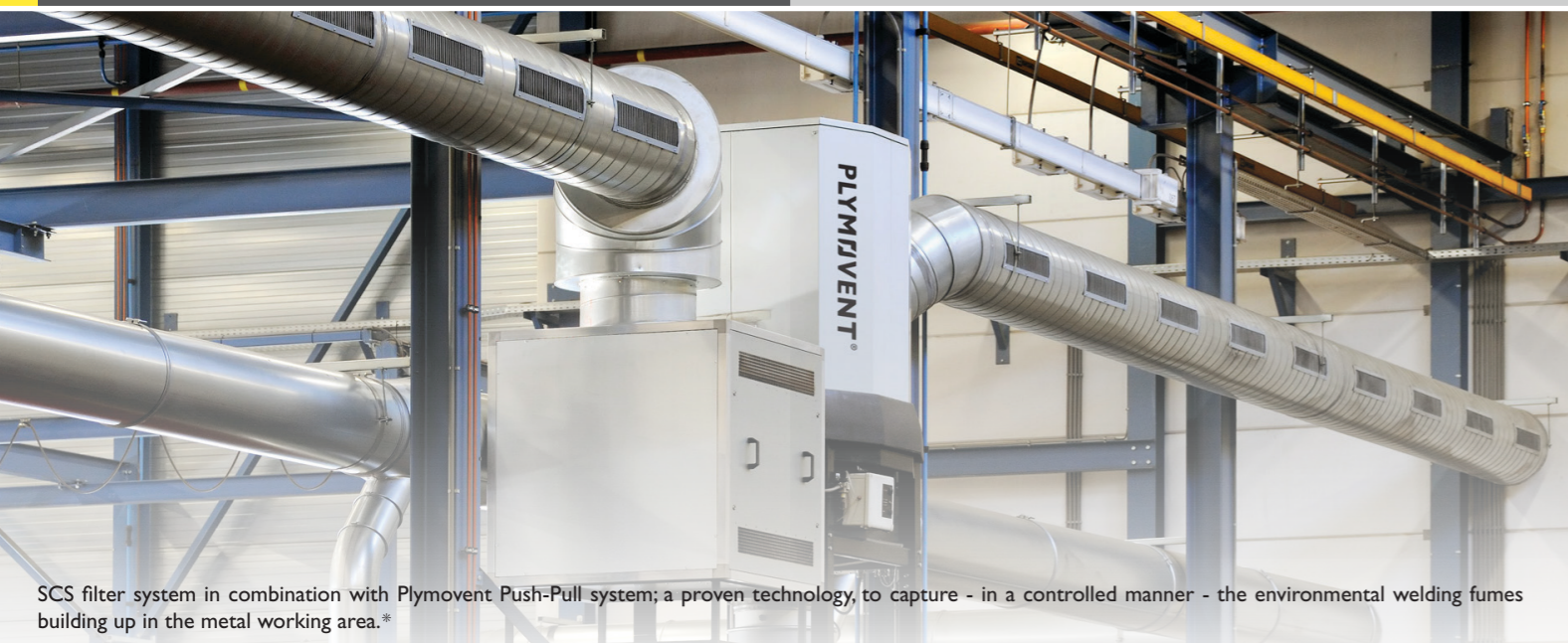
SCS filter system in combination with Plymovent Push-Pull system; a proven technology, to capture - in a controlled manner - the environmental welding fumes building up in the metal working area.*