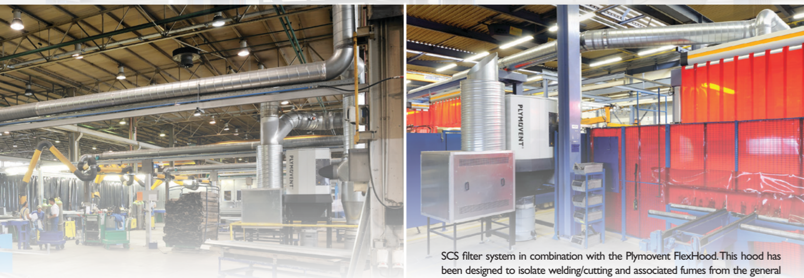
A multiple arm system in combination with a SCS filter system.*