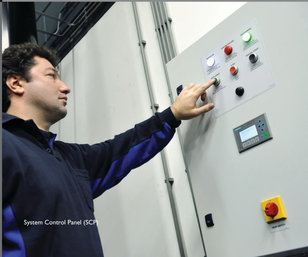
System Control Panel (SCP)

Fire detectors are placed inside the filter unit and within the main ductwork. They are designed to detect fire both whilst the system is in operation and also when it is switched off.