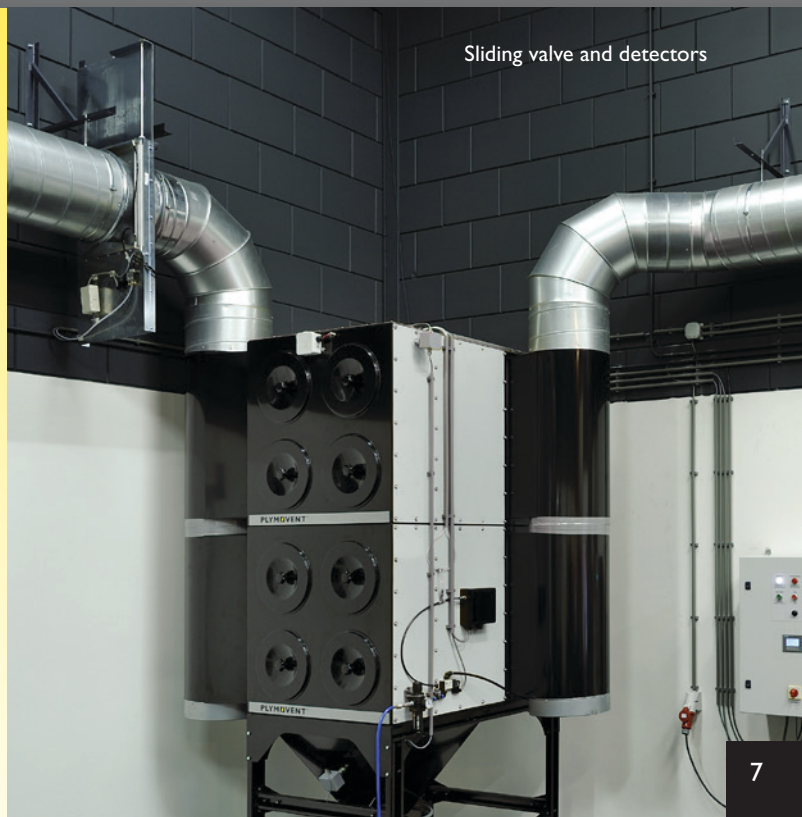
Sliding valve and detectors